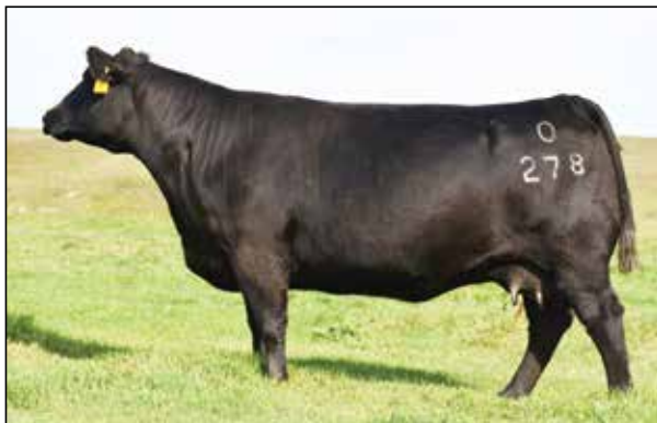
S Blossom 0278 – Dam of S Cornerstone 607.

Calving Ease: ♦ Dam's Production: 5@110 Do not miss out on this sleeper! This ET calf is a sure-shot heifer bull and put together extremely well. His dam, Pine Coulee Black Annie U7, was the high-selling cow in the 2018 Pine Coulee female sale selling to NorthWay Cattle Co. out of Canada for $31,000. Combine her with Flat Top and this bull is sure to produce cows that raise calves that smash down the scales at weaning time.