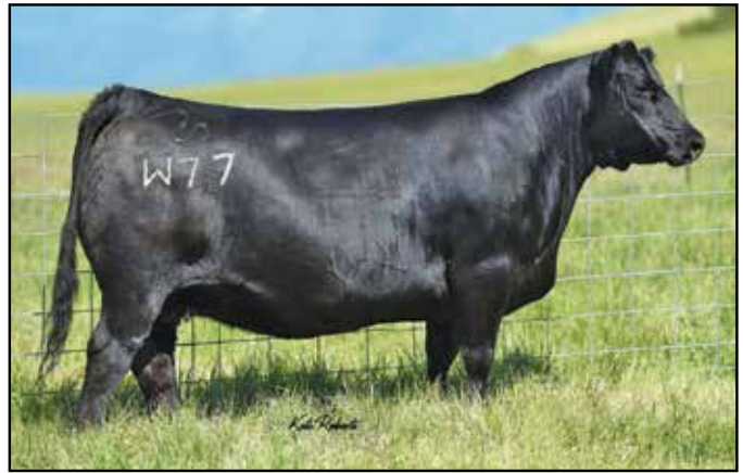
Pine Coulee Everelda W77 – Dam of Lots 15 & 16

These two flush brothers are bound to catch your eye on sale day. Their Net Worth-sired dam, Pine Coulee Everelda W77, is a donor cow at Pine Coulee Angus. She is a very powerful cow with excellent feet and udder as well as a great disposition. These calves are very smooth made and complete. Expect these bulls to sire females who are very attractive and feminine, and stay in your herd for a long time.