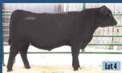
This S Summit 4604 son sells!