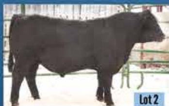
This U-2 Coalition 206C son sells!