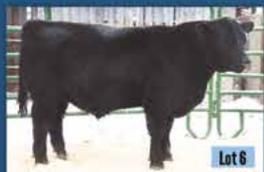
This U-2 Coalition 206C son sells!