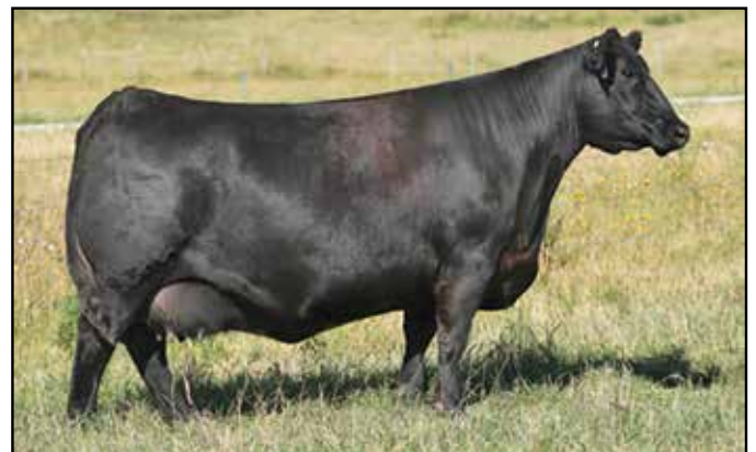
U-2 Erelite 109Z

Calving Ease: ♦ Dam's Production: 5@98 A one-star heifer bull out of Coalition and 2134. A maternal package here. Moderate framed, the Coalitions should be well liked for our Wyoming environment.