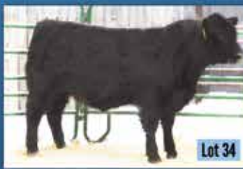
This Marcys Scalebreaker N Plus son sells!