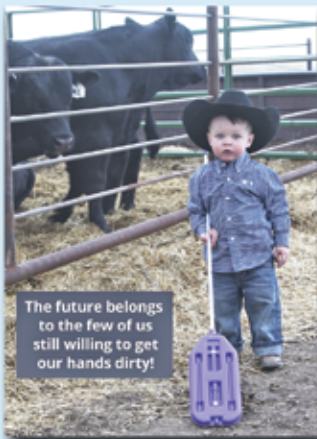
The future belongs to the few of us still willing to get our hands dirty!

All the bulls in the sale have passed a breeding soundness exam, tested negative for PI BVD and have been PAP scored. The bulls will be at M-Diamond Angus Ranch by noon on March 23, 2021, for inspection prior to the sale. If you have any questions, please feel free to call or e-mail.