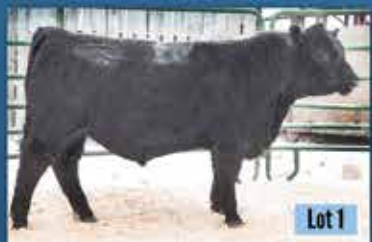
This HA Cowboy Up 5405 son sells!