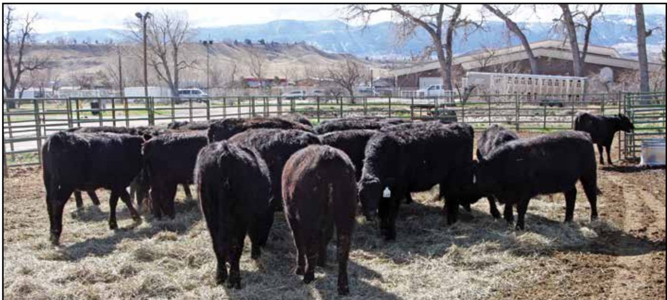
Lisco Angus commercial heifer calves.