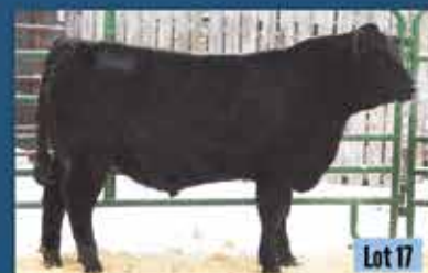
This LD Capitalist 316 son sells!