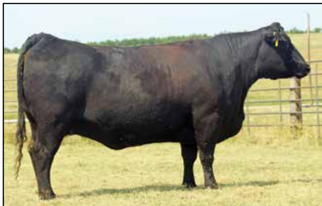
Marcys 13 Ethelda E 15-3 – Dam of Lot 14.

An extremely deep-bodied and heavy muscled bull. He has really turned the crank since weaning. He'll have a lot of friends on sale day!