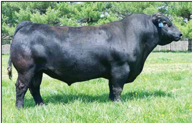
LD Capitalist 316

Here is a Cap 316 son with a little more scale than most of the 316 progeny. He is out of a great-uddered Cornerstone daughter who goes back to the Pathfinder® 83-0 cow who earned her way to our donor pen. This bull will sire calves that come easy but do not sacrifice performance.