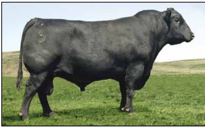
Sitz Alliance 6595 – Sire to Lots 60 & 64