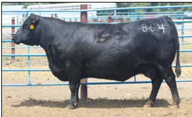
Marcys Erica 864 – Dam of Marcys Cedar Ridge. His daughters have beautiful udders.

Calving Ease: ♦♦ Dam's Production: 2@102 A two-star 536 son that is balanced and smooth made. Our 536 daughters are easy fleshing with near-perfect udders.