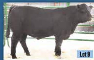
This U-2 Coalition 206C son sells!