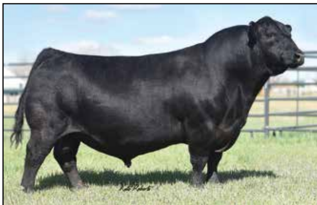
KG Justified 3023 – Grandsire of Lot 30

Calving Ease: ♦♦♦ Dam's Production: 5@104 This bull does a lot of things right. He is a two-star heifer bull with a Birth Weight EPD that is Top 4% in the breed. However, this bull does not sacrifice performance and touts a 109 weaning ratio. His dam is a product of a very successful flush that combined Final Answer and the great 528 cow.