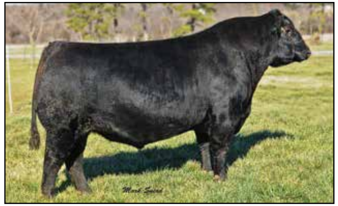
Bruin Uproar 0070

Here is a calving-ease bull whose pedigree spells maternal. This bull is very smooth made and easy on your eye; he is put together very well. His dam is very fertile and is bred back AI every year.